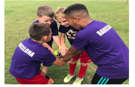
*This photo was taken prior to COVID-19 restrictions

Bring them to your academy session, week commencing 28th September 2020.